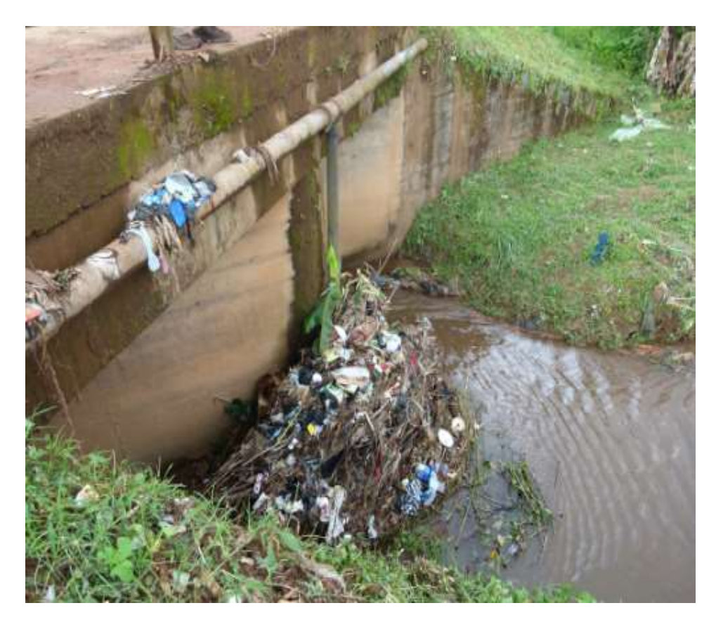
Figure 2. River with garbage dumped into it.

subsistence farmers. The major development trends fall under, rehabilitating existing road network and creating new ones, reclaiming and developing wetlands and daily collection and disposal of garbage. Some of the greatest short-comings are the dilapidated state of roads and other networks; the poor state of habitations, especially in urban slums; the problem of waste management and drainage. Additionally, water and sanitation crisis, many homes do not have proper toilets. There is the haphazard digging of latrines and burials near habitations, with potentials to pollute the little underground water available. About 1,500 people are farming and grazing on the different watersheds of Age for and Bamendankwe and Akum, constituting the biggest threat to the forest, soil and water conservation in the area. The people at the foothills, plains and valleys (Mankon, Nkwen, Bamendankwe, Njah, Mbatu, Nsongwa, Chomba), estimated at more than 500,000, and the population of the Tubah Sub Division (Bambui, Kedjom, Sabga, Kedjom, Bamessing), estimated at more than 350,000, need the water from the watershed uphill. These areas constitute the slums of the city, with streams choked by forest and agricultural plants, and sanitary conditions are very poor, with malaria epidemics and periodic cases of cholera (Figures 2 and 3)