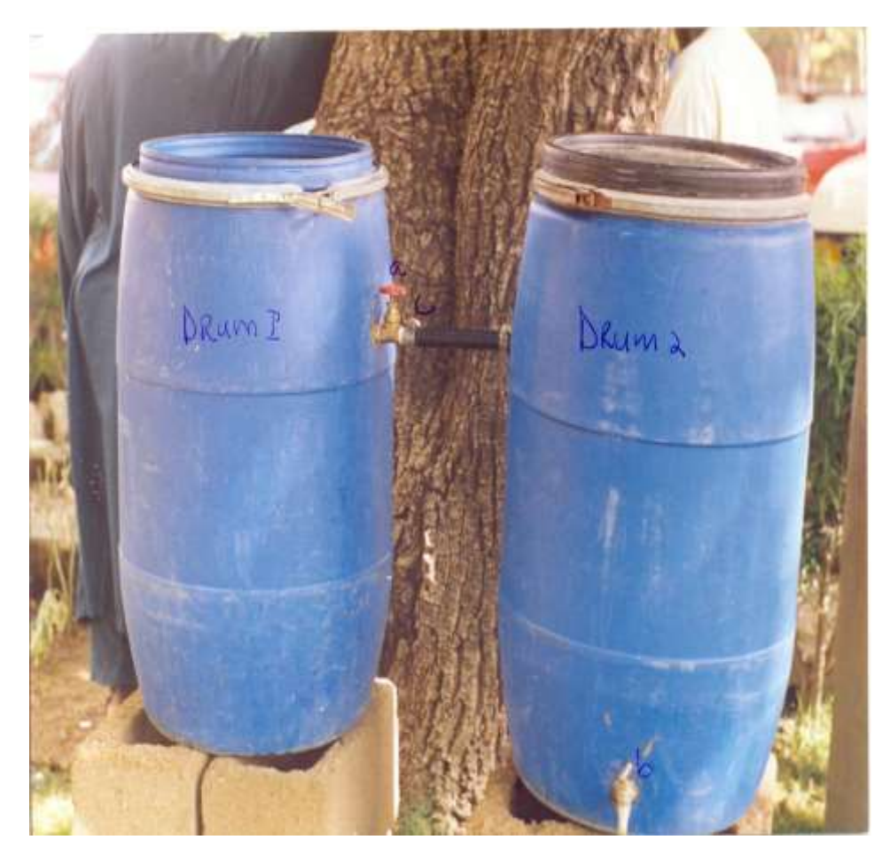
Figure 4. Sand filter drum. Drum 1 (left), sand filter media; drum 2 (right), collection /storage of filtered water.