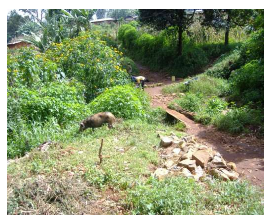
Figure 3. Subsurbs of Bamenda, a foot bridge with stray pig feeding close to a water fetching point.