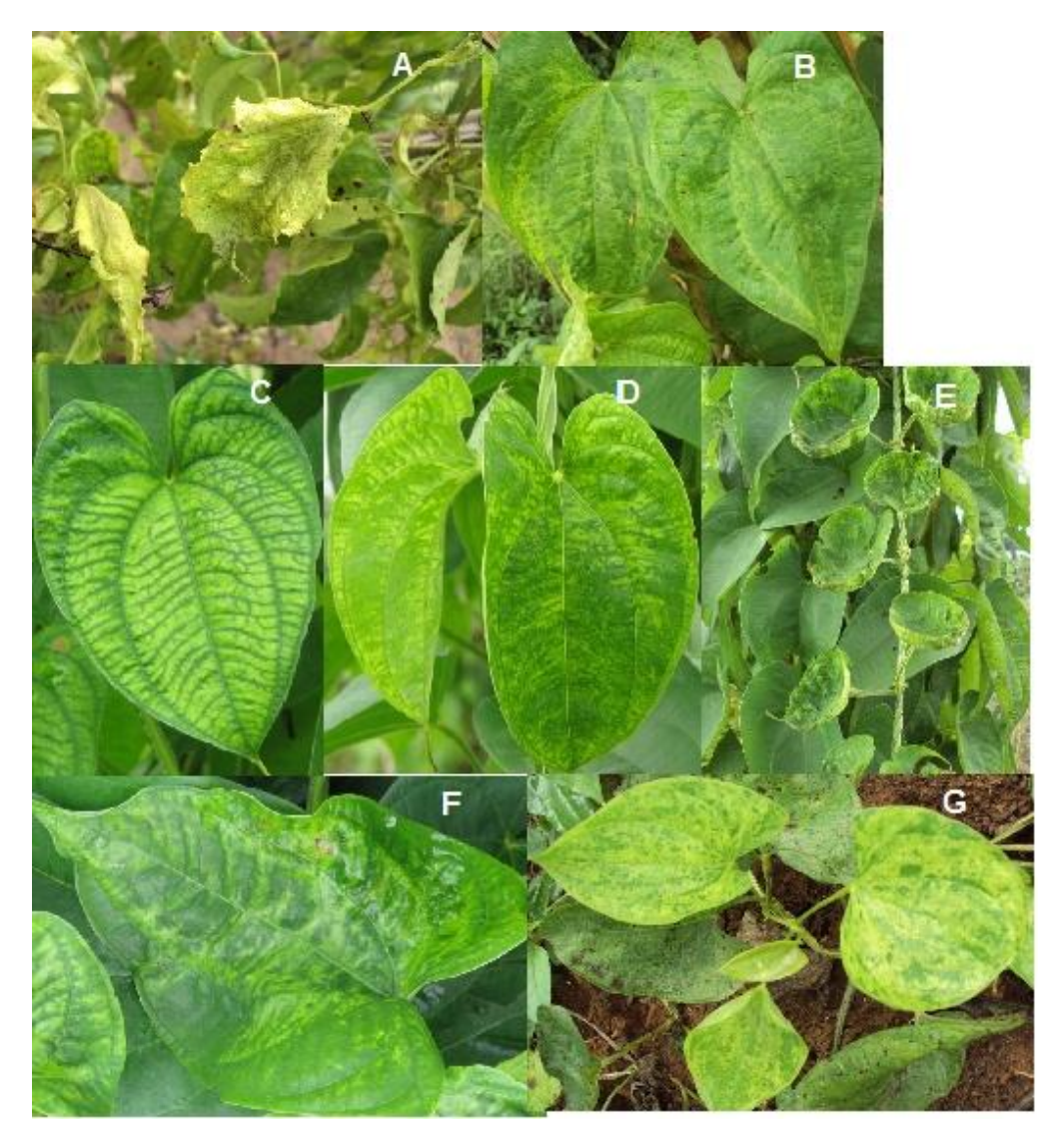
Figure 2. Various symptoms types observed on yam in Côte d'Ivoire. (A) Leaf distortion; (B) Mosaic; (C) Vein banding; (D) Mottling; (E) Coiling; (F) Mosaic and mottling; (G) Mosaic and bleaching.

Badnaviruses and YMV were detected in all the six zones. Mixed infections were highest in the Center, East and in South zones, but CMV incidence was low (Table 2). Virus disease incidence in the six yam production zones varied from 7 to 52% and the severity from 1.7 to 3.6%. Incidence was highest in the Central region and lowest in the Northern region. There seems to be a gradient in the disease incidence, with the highest in the South and the lowest in the North. Viral disease incidence was generally low in the North; however, in one location (Boundiali), the incidence was higher (20%) than in the other areas in the North (Table 3).