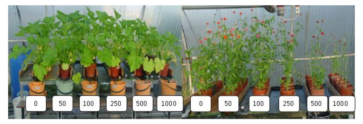
Figure 1. Effects of Si concentration (in mg L<sup>-1</sup>) on growth of zucchini (left) and zinnia (right) in nutrient recirculating system.