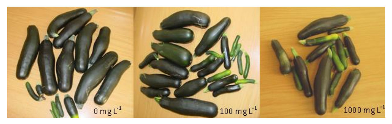
Figure 2. Effects of Si concentration on fruits of zucchini grown in nutrient recirculating system.

on the accumulation of this element by zinnia were similar to that in the case of zucchini. As much as 92.6 mg g<sup>-1</sup> dw of Si was accumulated by the leaves of zinnia, with 250 mg L<sup>-1</sup> of Si considered to be the optimum. The roots of this plant also accumulated the maximum level of Si (24.2 mg g<sup>-1</sup> dw) when supplied with Si at 150 mg L<sup>-1</sup>. The level of Si in the flowers of zinnia was doubled when the plant was supplied with 50 mg L<sup>-1</sup>. However, subsequent increases in Si supply did not result in increased deposition of this element in the same tissue. Regardless of Si levels in the nutrient solution, the accumulation of Si in the fruits of zucchini and the stem and petioles of both plants was not affected.