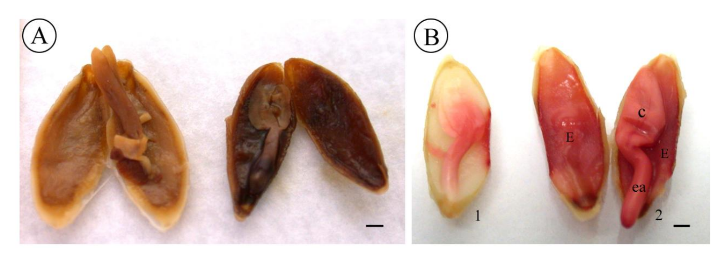
Figure 3. Necrotic embryos (A) and seeds stained with 1% TTC solution (B). 1, not viable; 2, viable embryos; c =cotyledons, E = endosperm; ea = embryo axis. Bar 1 mm.

in not treated seeds, also in cryopreserved seeds, gibberellin addition had a significant effect on germination of seeds collected in July and in November desiccated to 6% MC, while there was no significant effect of gibberellin only in cryopreserved seeds collected in November and desiccated to 3% MC. The use of full mature seeds cryopreserved with 3% MC would avoid the addition of gibberellin, that at the beginning of the plant growth, had a negative effect on epicotyl development (longer than controls) and on the leaves that were scrubby. The seeds collected in July were able to be cryopreserved with 6% MC, but to induce germination, the addition of gibberellin is essential. The possibility to cryopreserve these seeds could eliminate the risk of losing the samaras due to early dissemination.