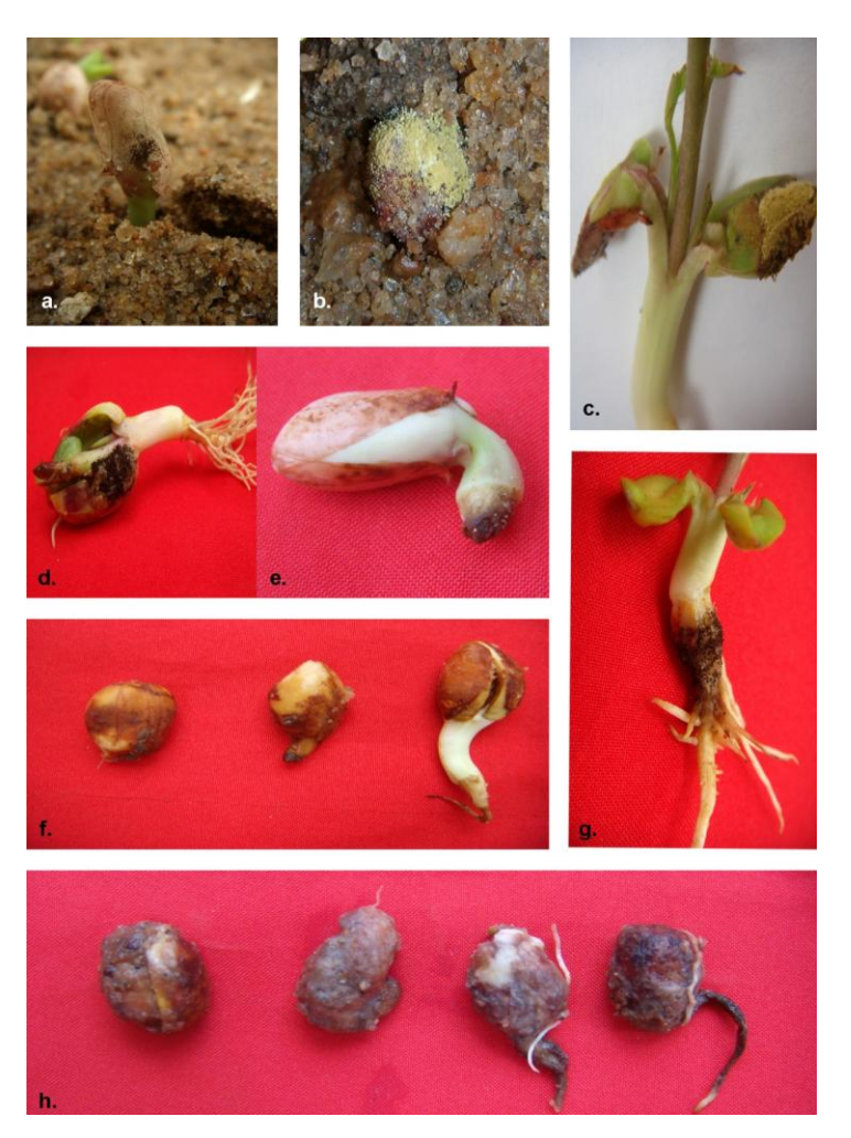
Figure 1. Groundnut with varied degree of seed-borne fungal infection showing various seedlings abnormalities. a, b and c. Cotyledons of emerging seedlings colonized by A. niger and A. flavus . d – g. Abnormal root formation, h. seed and seedling rot.

different seed samples collected. This is because the standard blotter method (SBM) which we followed did not give information about the intensity of A. flavus infection in seeds.