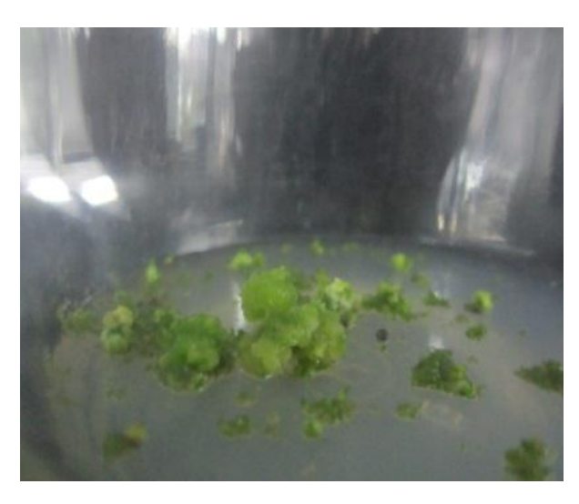
Figure 4. Clumped protocorms on MS medium supplemented with 0.5 mg/L BAP after 10 weeks of culture.

three different hormonal combinations of the medium (Table 1). Similar findings were also reported by Basker and Narmatha Bai (2010) in the seed germination of Eria bambusifolia which took 7 weeks for protocorms formation, Pant et al. (2011) on Phaius tancarvilleae which took 9 weeks and Gogoi et al. (2012) on Cymbidium eburneum which also took 9 weeks. Clumped protocorms were observed in this case on MS medium supplemented with 0.5 mg/L BAP after 10 weeks of culture (Figure 4). The first shoot initial was obtained after 11 weeks of culture on MS medium supplemented