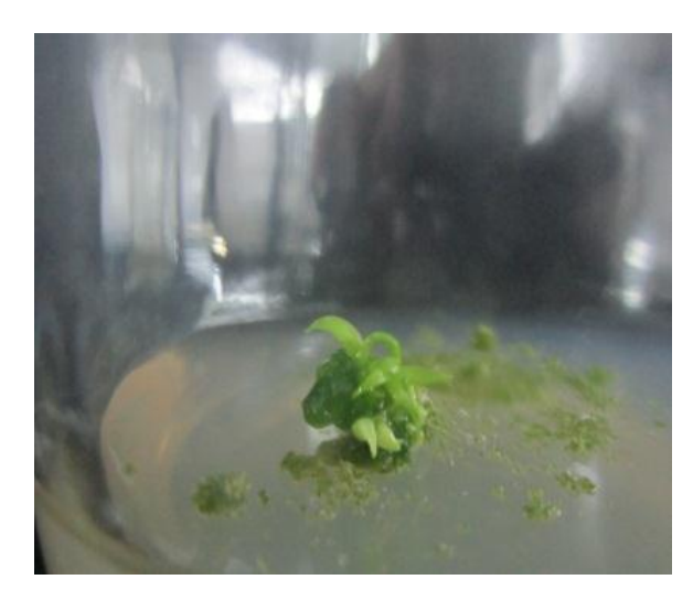
Figure 6. Formation of shoots on MS medium supplemented with 0.5 mg/L BAP after 20 weeks of culture.

medium supplemented with BAP (1 mg/L) and NAA (1 mg/L) while on MS medium supplemented with 0.5 mg/L NAA it was observed after 25 weeks of culture (Figure 8). Pradhan and Pant (2009) in the seed germination of D. densiflorum found 19 weeks needed for the first root formation.