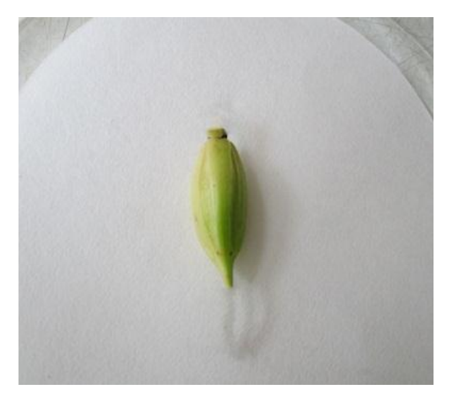
Figure 2. An immature capsule.

fever (Baral and Kurmi, 2006). Owing to its high demand in the national and international markets, over collection from its natural habitat and slow growth rate in nature, this species is restricted only to narrow pocket areas in the nature.