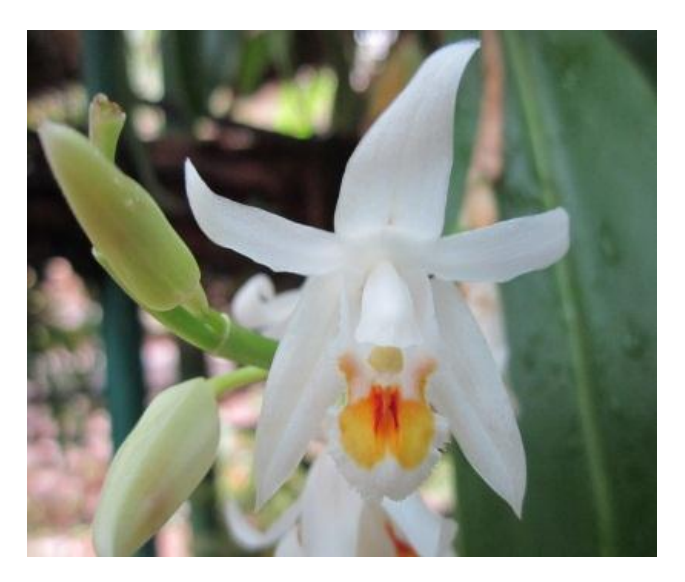
Figure 1. A flower of Coelogyne stricta.