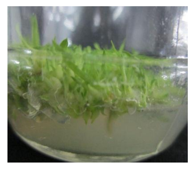
Figure 8. Initiation of root on MS medium supplemented with 0.5 mg/L NAA after 25 weeks of culture.

Complete plantlet of C. stricta was obtained after 23 weeks of culture. This was supported by the findings of Pant et al. (2011) on P. tancarvilleae which took 24 weeks to develop into complete plantlets and Paudel et al. (2012) on Esmeralda clarkei which took 25 weeks. MS medium supplemented with BAP (1 mg/L) and NAA (1 mg/L) was found to be the best for seed germination of C.