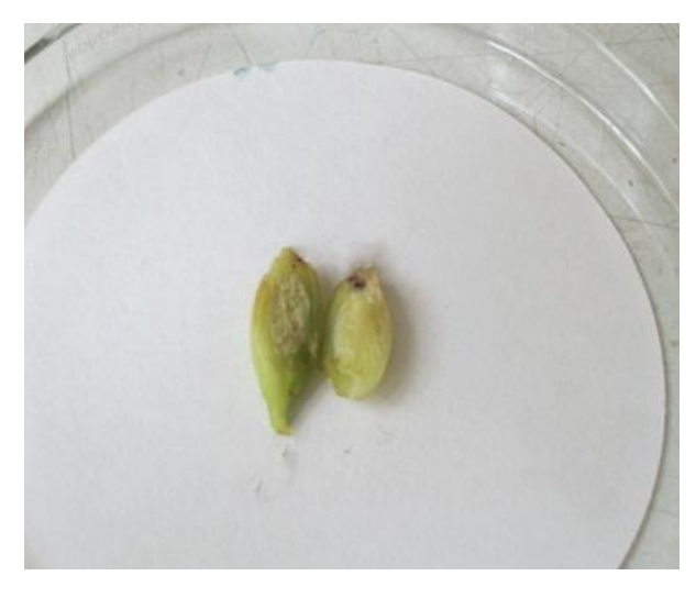
Figure 3. Capsule cut longitudinally into two halves.

Culture conditions: 25± 2°C, 32 weeks, 16 h photoperiod and 6 replicates were used in each combination.