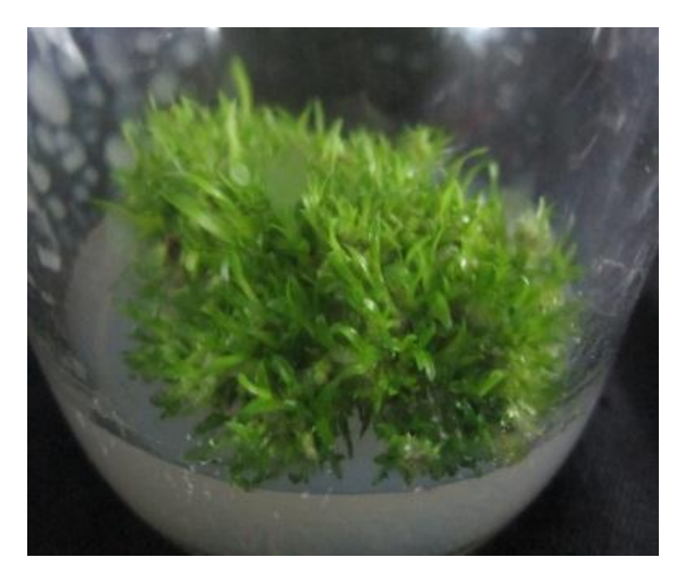
Figure 7. Shoots on MS medium supplemented with 1 mg/L BAP and 1 mg/L NAA after 20 weeks of culture.