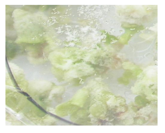
Plate 2. Somatic embryos obtained from explant that cultured at photoperiodic condition, from media contained 4 mg/l 2,4-D and 0.5 mg/l BAP.

environmental factors that have effect on somatic embryos induction. Angoshtari et al. (2009) found that, light stimulated somatic embryo formation and maturation in Brassica napus. It has been reported that somatic embryo responses differed between genotypes. Somatic embryos were obtained at either a photoperiodic or completely dark condition in grapevine (Tangolar et al., 2008) and at dark in sweetpotato (Trigui et al., 2008). High frequency of somatic embryogenesis was observed on MS medium when 2,4-D and BAP was added. The best embryogenic response was obtained on the medium containing 4 mg/l of 2,4-D combined with 0.5 mg/l BAP from cotyledon explant (20.00±7.94 SE per petri dish). SE numbers obtained from cotyledon and hypocotyls explants were 17.33±5.51 and 16.33±3.06 per petri dish, respectively, on the medium that 2 mg/l of 2,4-D and 0.5 mg/I BAP were added. Auxin was found critical for