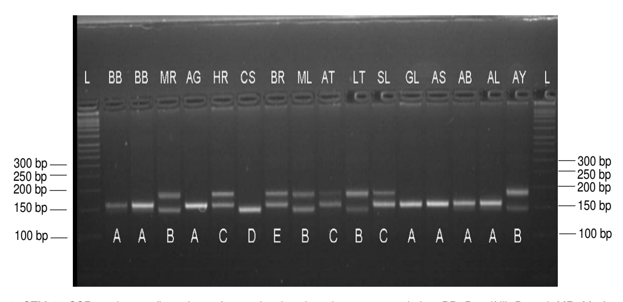
Figure 1. STM 19 SSR marker configurations of some local and modern potato varieties. BB, Başçiftlik Beyazi; MR, Marfona; AG, Agria; HR, Hermes; CS, Cosmos; BR, Burren; ML, Milva; AT, Agata, LT, Latona, SL, Slaney, GL, Gölköy; AS, Aleddiyan Sarisi; AB, Aybasti Beyazi; AL, Aleddiyan Beyazi; AY, Aybasti Sarisi. L: 50 bp DNA ladder (SIGMA S7025). Letters below the bands show the marker band configurations considering all bands produced in a variety.

BB, Başçiftlik Beyazi; MR, Marfona; AG, Agria; HR, Hermes; CS, Cosmos; BR, Burren; ML, Milva; AT, Agata, LT, Latona, SL, Slaney, GL, Gölköy; AS, Aleddiyan Sarisi; AB, Aybasti Beyazi; AL, Aleddiyan Beyazi; AY, Aybasti Sarisi.