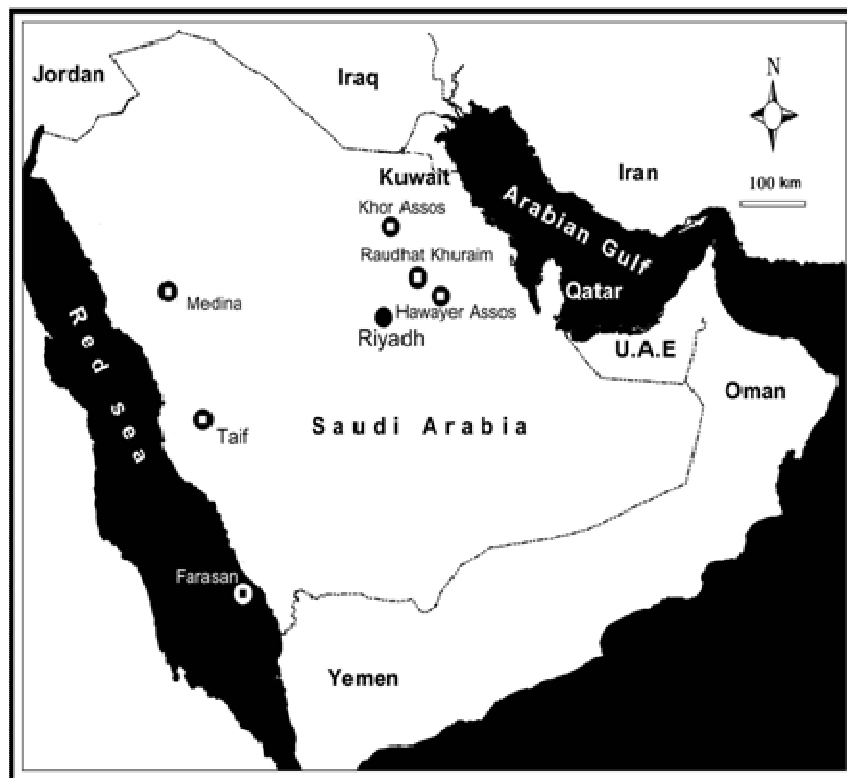
Figure 1. Map showing the locations of six analyzed populations of C. decidua in Saudi Arabia: Khor Assos, Raudhat Khuraim, Hawayer Assos, Medina, Taif and Farasan.