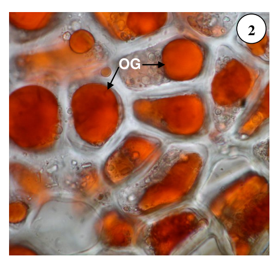
Figure 2. Micrograph by light microscope showing the accumulation of large oil globoids (OG) that appeared red orange after coloration with saudan red.

percentage of oils was 41% in Salvadora persica (Reddy et al., 2008), 20% in K. virginica (Ruan et al., 2008b), 30% in Salicornia brachiata and varied between 22 and 25% in Arthrocnemum indicum , Alhaji maurorum , Cressa critica , Halopyrum mucronatum , Haloxylon stocksii , Suaeda