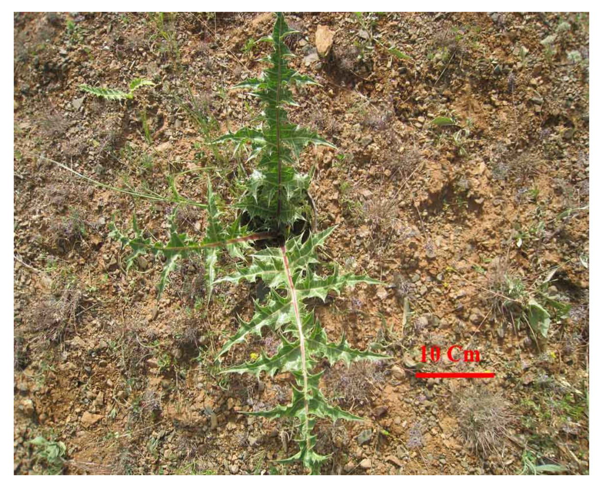
Figure 2. G. tournefortii L. species.