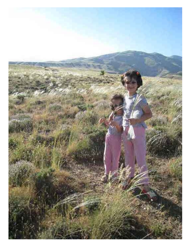
Figure 1. A part of Shanjan rangeland from Shabestar district, East Azerbayjan province, Iran.

Table 1. Scientific name for G. tournefortii L. classification report (USDA, 2011).