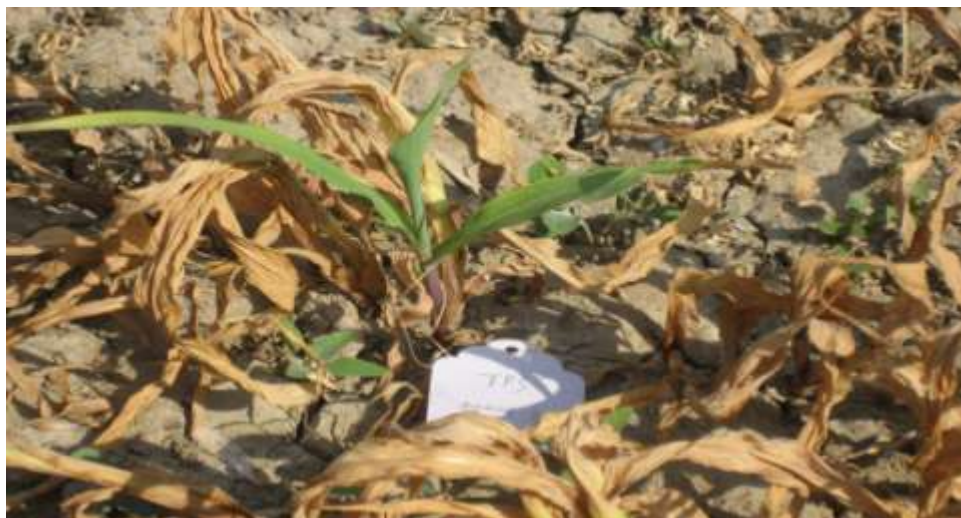
Figure 1. PPT resistance seedlings.