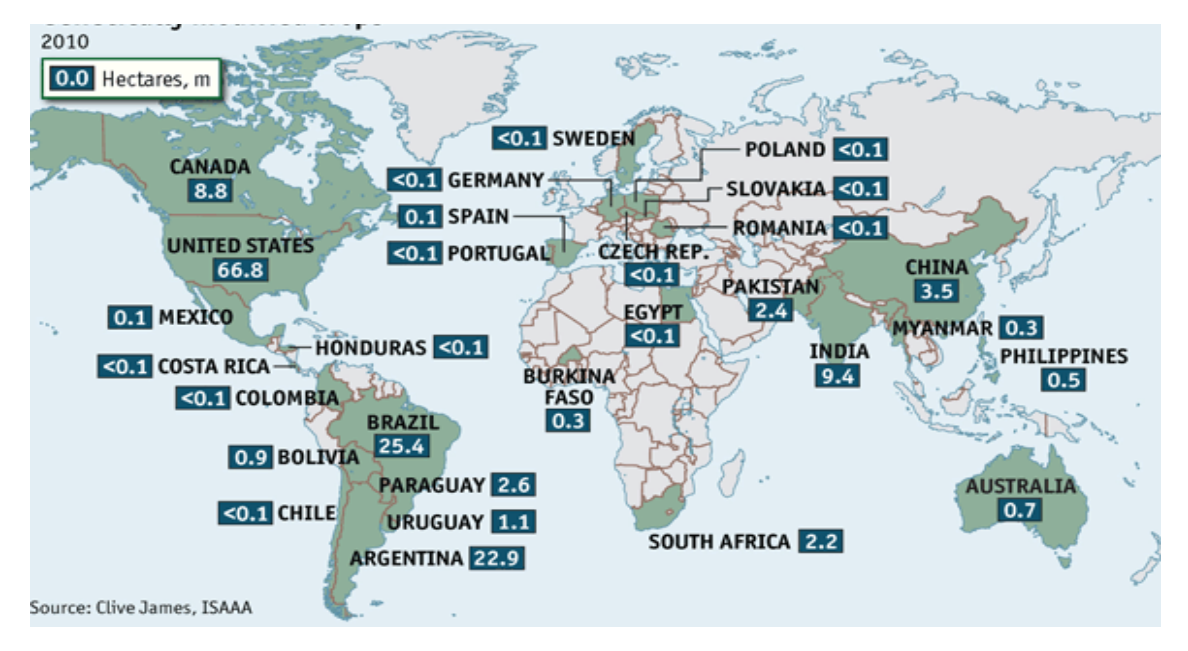
Figure 2. Major genetically modified crop countries in the world (James, 2010).