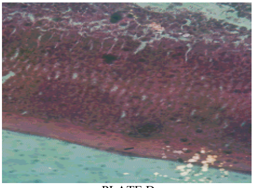
PLATE D Control

reduction in glandular tissue and there was 100% tissue loss in the lamina propria with numerous preudopits. The staining characteristics showed mild affinity for haematoxylin and moderate affinity for eosin dyes (Plate C).