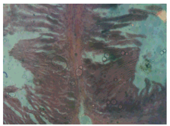
PLATE C CUC-T