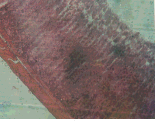
PLATE B CUC-NT