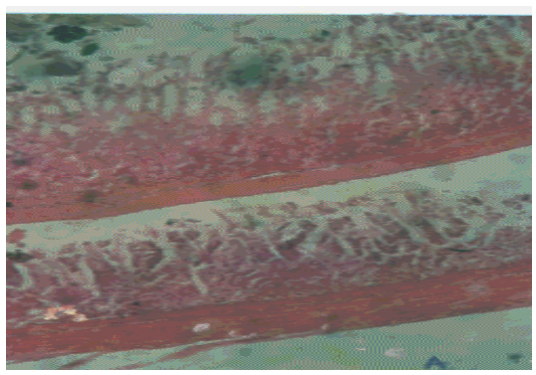
PLATE A CUC-F