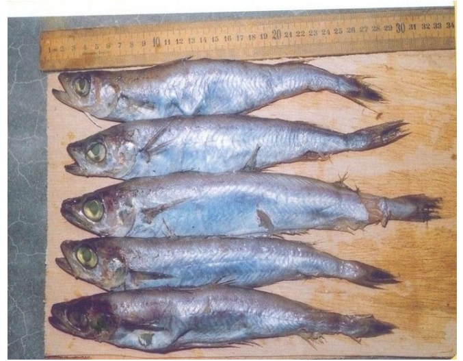
Figure 3: Frozen Hake as displayed in the Market

Contracecum sp( with microscopic arrow) attached to Fish liver at x40