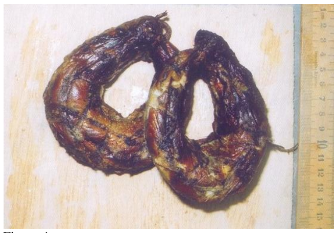
Figure 4: Smoked Hake as displayed in the Market