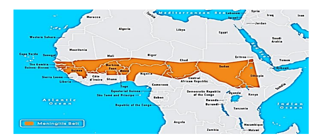
Fig 1: African Meningitis Belt