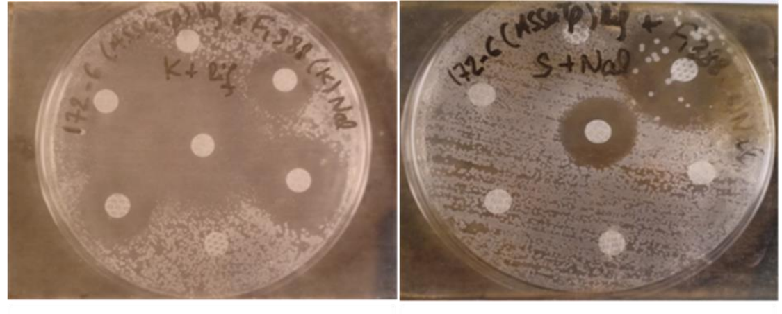
Figure-3: Grouping transconjugant E.coli 172-6 (ASSuTmp) in E.coli C600Rif with F1 386 (K) in E.coli K12 Nal, Selection dish K+Rif

A =Ampicillin, S=Streptomycin, Te=Tetracyclin, Su=Sulfamid, Tmp=Trimethoprim, K=Kanamycin, C=Chloramphenicol, Ge=Gentamycin