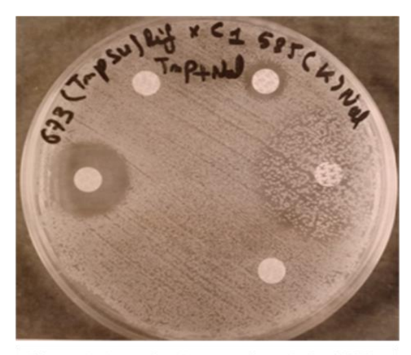
Figure-6: Grouping transconjugant E.coli 673 (SuTmp) in E.coli C600Rif with Com1 525 (K) in E.coli K12 Nal, in the opposite direction.