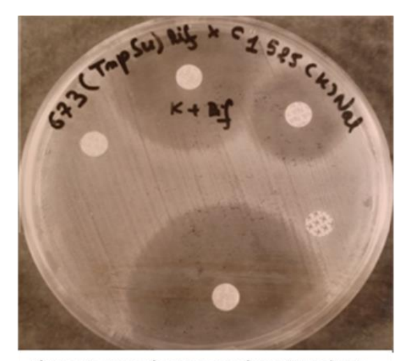
Figure-5: Grouping transconjugant E.coli 673 (SuTmp) in E.coli C600Rif with Com1 525 (K) in E.coli K12 Nal.