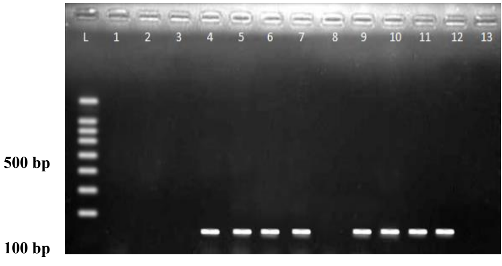
Lane L=DNA Ladder (100bp), Lane 1-13 = Positive for FOX gene