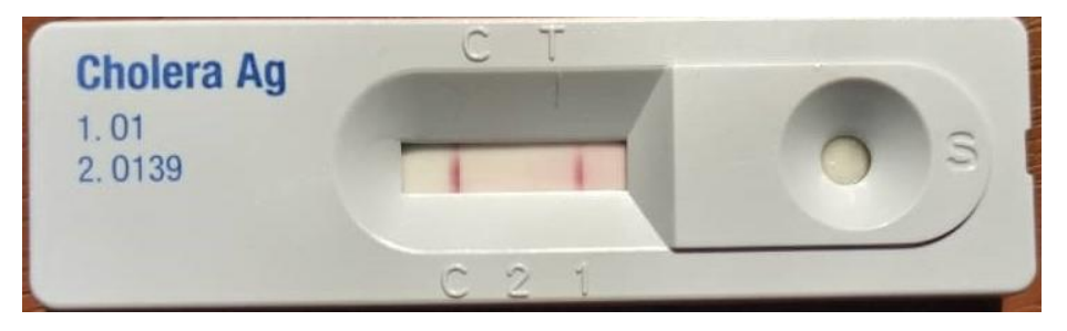
Fig 3: Confirmation of Vibrio cholerae serotype 01 on immunochromatographic cassette