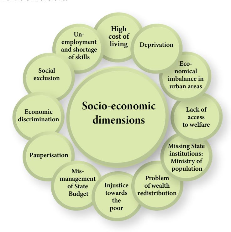
Figure 2: Socio-economic dimensions in situations of escalation

urban areas or deprivation. These built up situations of frustration and aggression throughout the process, which explains the involvement of various social groups in the conflict, especially the poor population from the slums. Figure 2 maps out these main issues relating to the socio-economic dimensions.