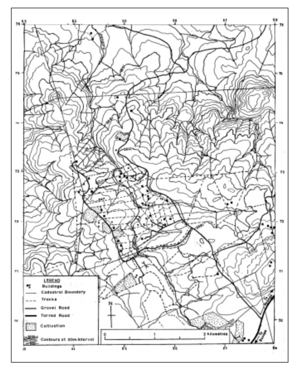
JULIASDALE (see note 13)