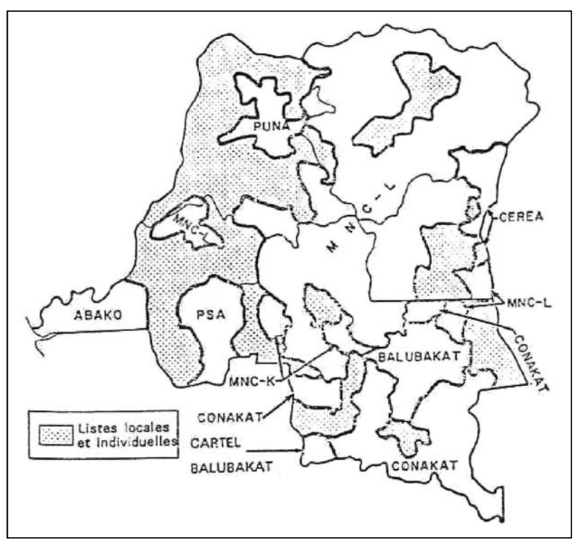
Source: Young 1968:159. Adapted from the electoral map of the Congo, prepared by J.H Pierre, Brussels, ARSOM, 1961. In this map, the PNP is not indicated separately, but is included in the category of local and individual lists.