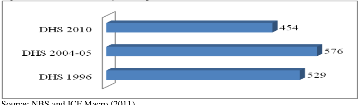
Figure 1: Maternal Mortality Ratio (per 100,000 live births)

100,000 live births in 1996 to 265 per 100,000 by 2010 has not been realized. The latest Tanzania Demographic and Health Survey estimates the Maternal Mortality Ratio (MMR) at 454 deaths per 100,000 live births (Figure 1). The 2013 "State of the World's Mothers Report" ranks Tanzania as the 135<sup>th</sup> worst country for mothers globally, and places it in the leading ten countries for the most number of newborn deaths and most first-day deaths (Save the Children, 2013). This means that concerted efforts are needed to translate policies and strategies into actions by allocating requisite resources for their implementation.