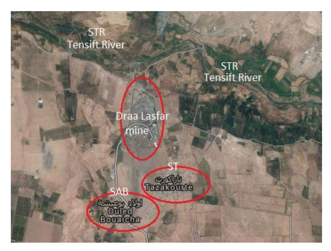
Figure 2. Geographic situation of OuledBouaicha and Tazakourte rural communities.

the mining site as control soils (background) in order to avoid mining contamination.