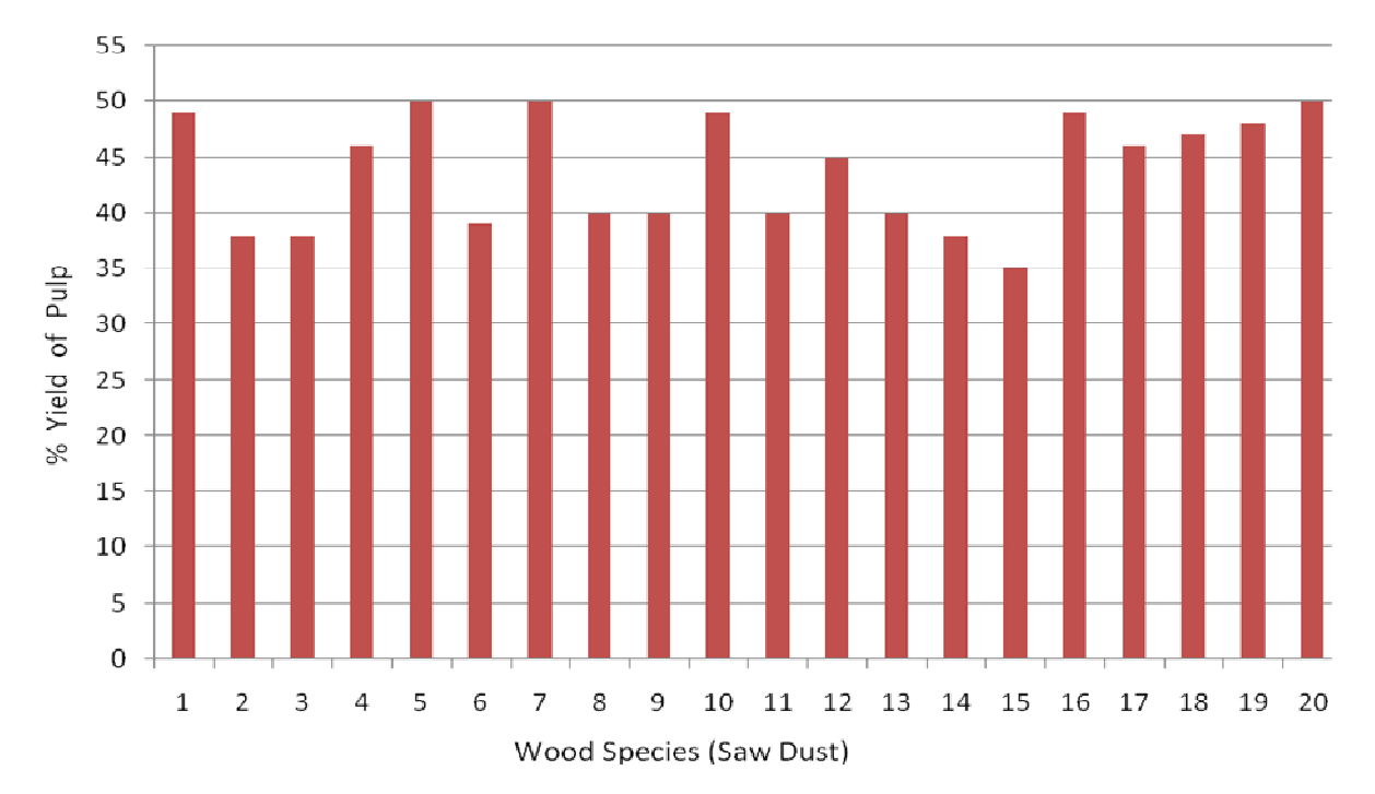
Figure 2. Percentage yield of pulp from various wood species at 28.5.0% sulphidity, 21.5 % effective alkali and 24.5% active alkali.1. Pycnanthus angolensis , 2. Avicennia germinans. , 3. Uapaca guineensis , 4. Pterygota macrocarpa , 5. Hallea ciliate , 6. Masonia altissima , 7. Terminalia superb , 8. Entada gigas , 9. Khaya ivorensis , 10. Triplochiton scleroxylon , 11. Strombosia pustulata , 12. Ipomoea asarifolia , 13. Sacoglottis gabonensis , 14. Lophira alata , 15. Milicia excels , 16. Ceiba pentadra , 17. Ricindendron heudelotii , 18. Erythropleum suaveolens , 19. Nauclea diderrichii , 20. Symphonia globulifera .