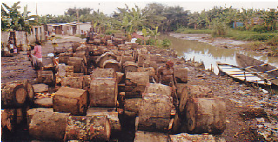
Figure 3. A mangrove wood market behind the Douala international airport.

and leaves are seldom of interest to the loggers (less than 2 percent). Consequently, they constitute an important loss during the mangroves exploitation. The real production of mangroves is greater than half million cubic meters per annum, but it is mostly discarded as litter.