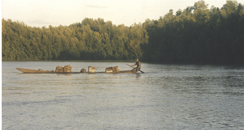
Figure 2. Overloaded canoes with mangroves wood in the Wouri River (Douala).