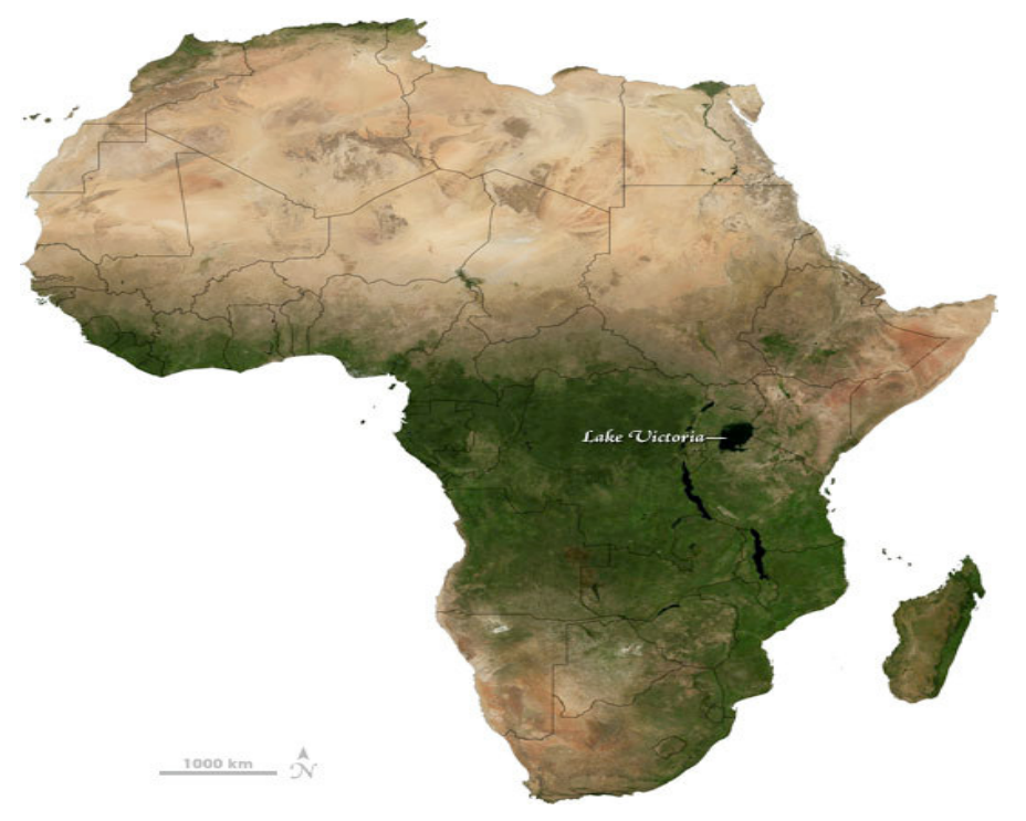
Figure 1. The physical geography profile of Africa resemble a face looking Eastward with Lake Victoria representing the "eye" gazing adoringly at Madagascar. Image by courtesy of NASA. http://earthobservatory.nasa.gov/Study/Victoria/victoria.html.

The beginnings of such coordinated research efforts are apparent in the eleven articles presented in this special edition of the African Journal of Environmental Science and Technology. These articles present extremely valuable findings on indigenous knowledge, land use management, pollution, and socioeconomic sustainability. Collectively, they represent a small but important cohort of research being conducted on Lake Victoria Basin. The articles should also serve as inspiration for additional research.