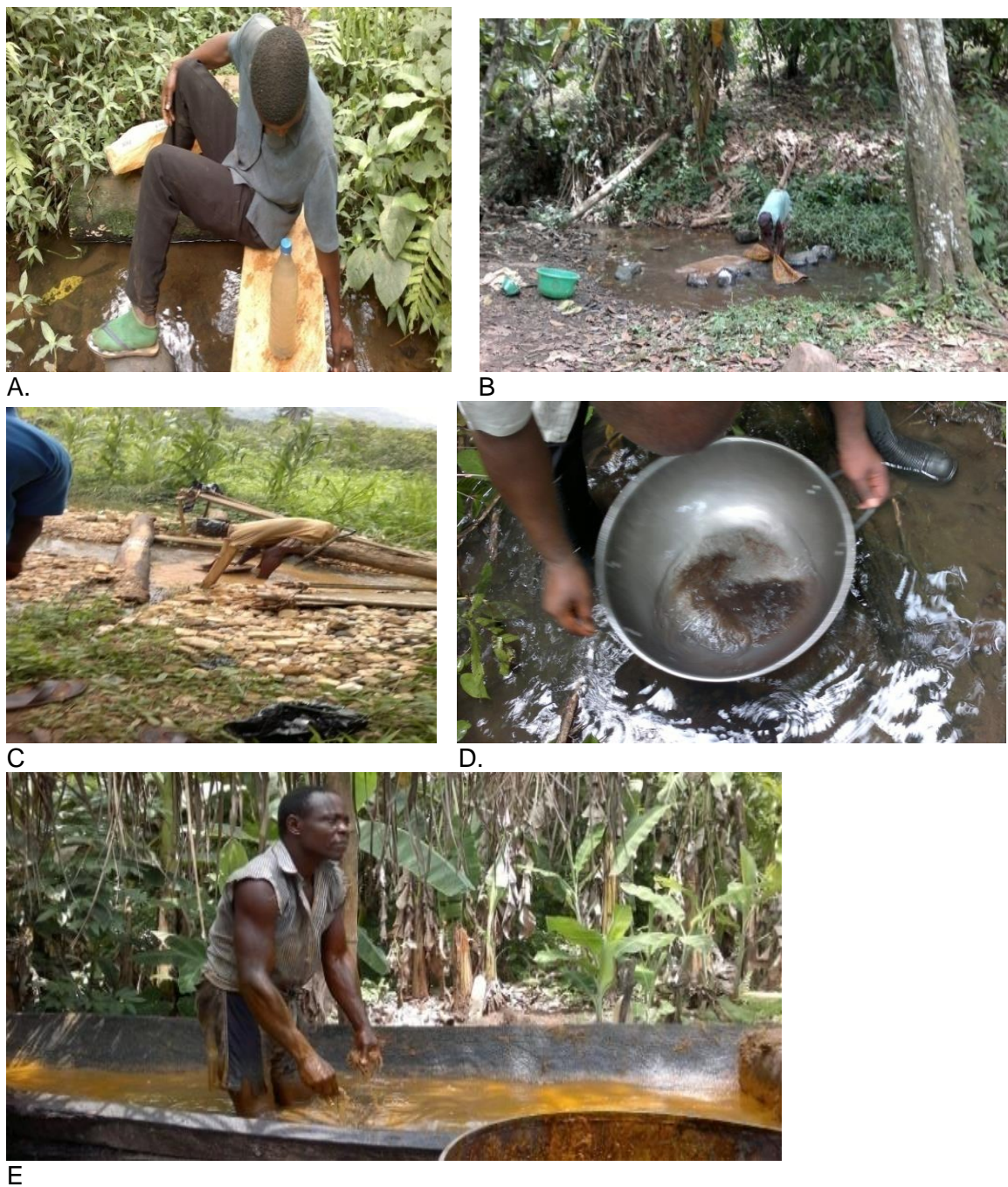
Figure 1. Different uses of stream water in the area: (A) Drinking, (B) Laundry, (C and D) Sieving to concentrate dug pit, (E) Production of palm oil from palm fruit.

highest mean concentration recorded in dry season from stream water sample at Oko-Ogboni while Sabo village water sample had the least concentration of Cu (Figure 3D) with 0.457 \pm 0.061 and 0.364 \pm 0.056 mg/L in dry and wet seasons. The mean range concentration of copper in both seasons (dry and wet) was (0.294 \pm 0.021 to 0.890 \pm