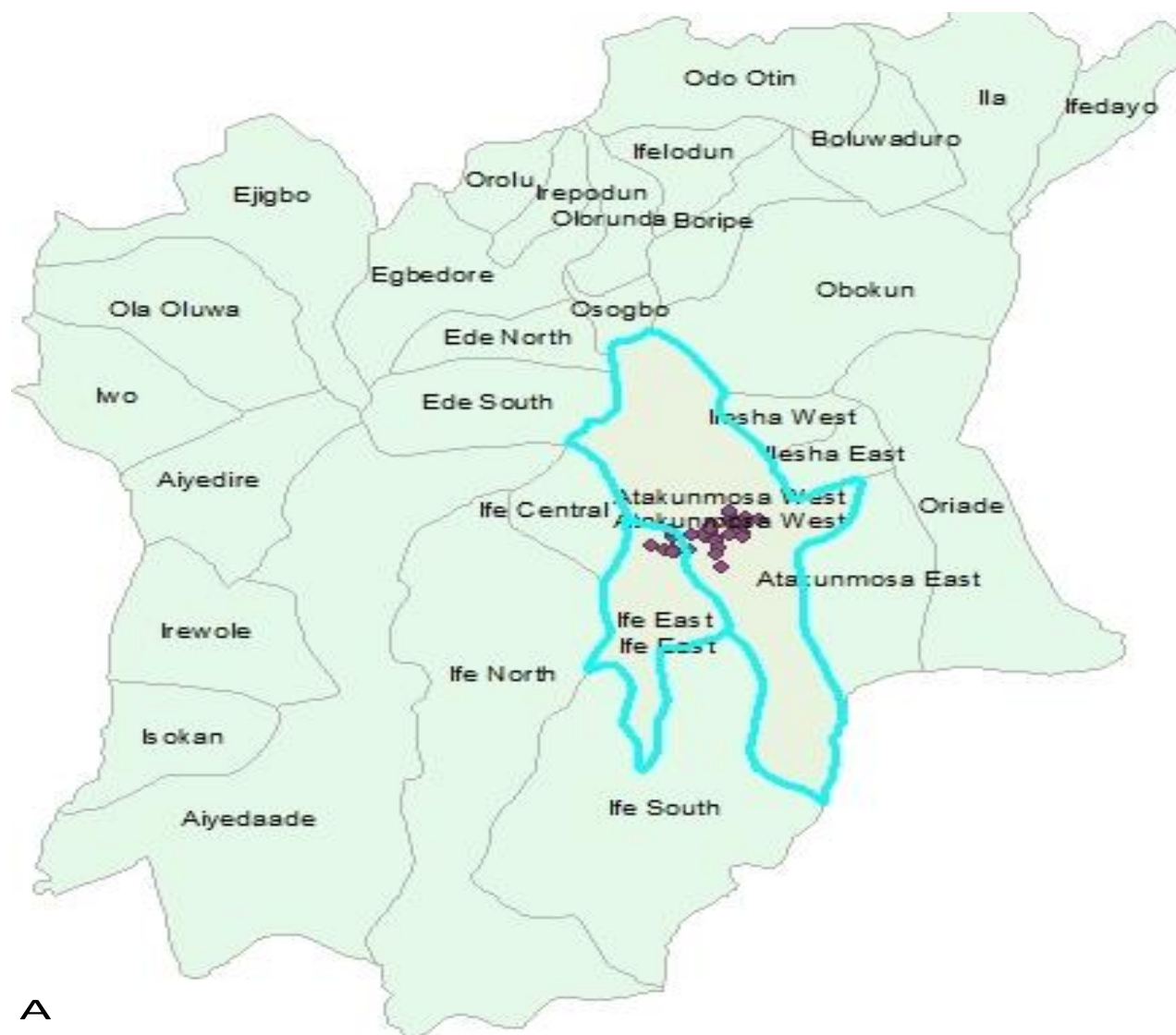
Figure 2a. Map of Osun State, Nigeria showing the studied area (B) and the sampling points.