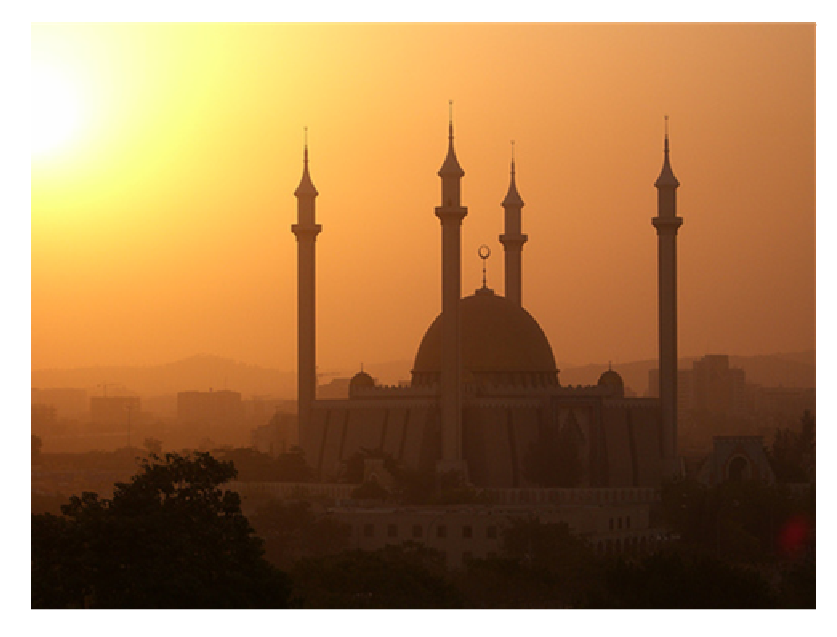
Figure 1. The mosque in Abuja Nigeria, seen through the harmattan haze.

It is the season to cover up. Beginning in November of every year and ending around March, fine particulate matter (typically 0.5 – 10 micrometers) emanating from the Sahara desert blow south, obscuring vision and laboring breathing for everyone (Figure 1). In addition, the dry dusty winds cause a variety of domestic inconveniences because of the layers of dust that envelope everything both outdoors and indoors. This is harmattan season, and it is ingrained in all West