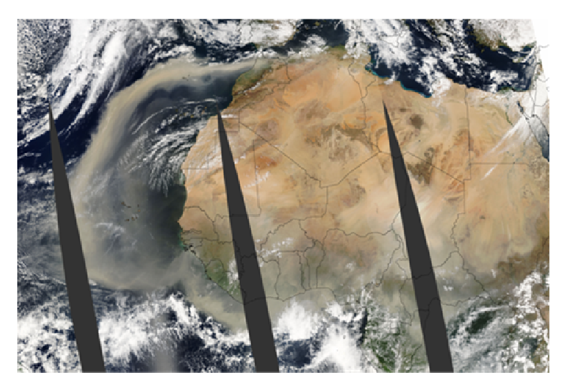
Figure 2. Harmattan dust storms from the Sahara desert as captured by NASA's MODIS satellite reaches across to the Atlantic Ocean in the South, and all the way to South America and the Caribbean islands<sup>2</sup>.