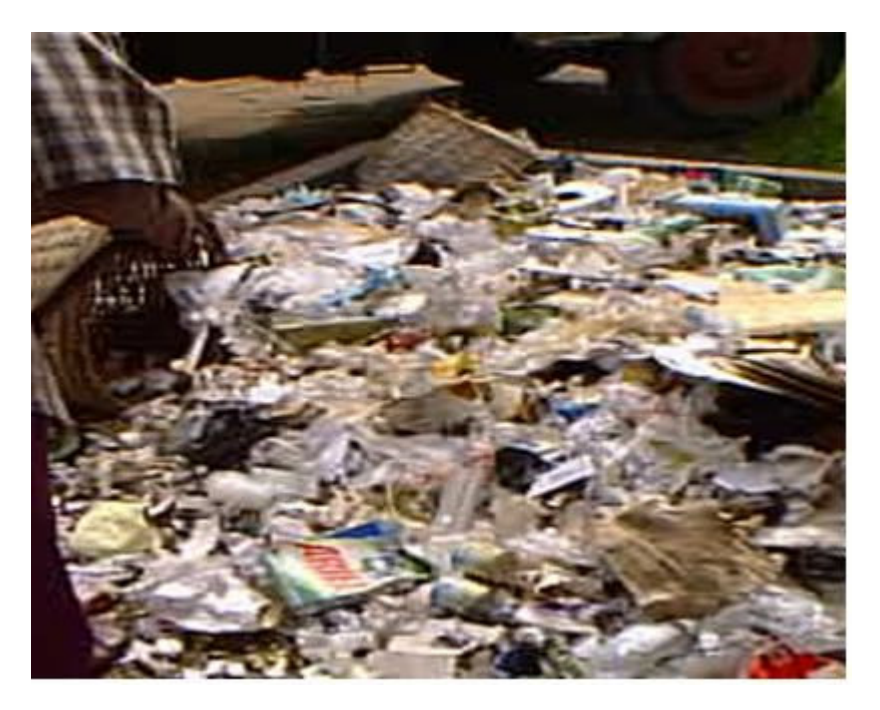
Plate 3. Temporary storage depot for healthcare waste in an Ibadan HCF.