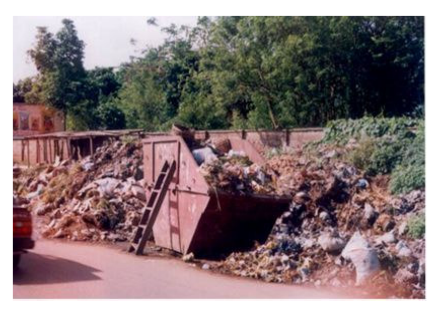
Plate 1. Skip used for collecting health-care waste in an Ibadan HCF.