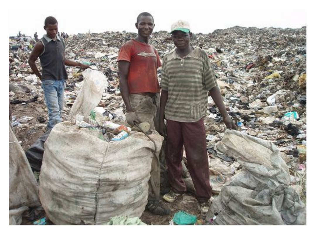
Plate 5. Scavengers susceptible to health risks at Aba-Eku, Ibadan.

Note: X indicates identified health risks.