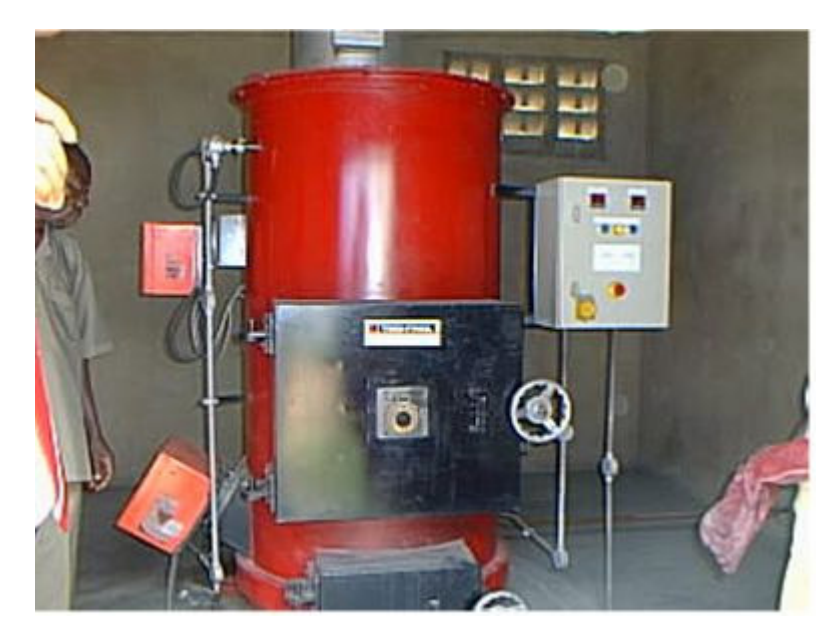
Plate 4. Over-utilized incinerator at UCH Ibadan.

cost of operating and maintaining them. The study of Coker et al (2000) revealed that acute pollution of the surroundinas stemmed from nearbv the hiah concentration of plastics and absorbents components of the HCW generated in UCH. Another problem with the quantity of UCH incinerator (Plate 4) is the small capacity (capable of burning 25 kg/hr) which makes it unable to cope with the HCW with which it is being overcharged. This incinerator was imported from Britain which did not last long before it was out of function and maintenance and getting spare parts has been a problem. The work of Sridhar and Coker (2009) recommended that while selecting the management method, the technical, human and financial resources of each facility should be kept in mind.