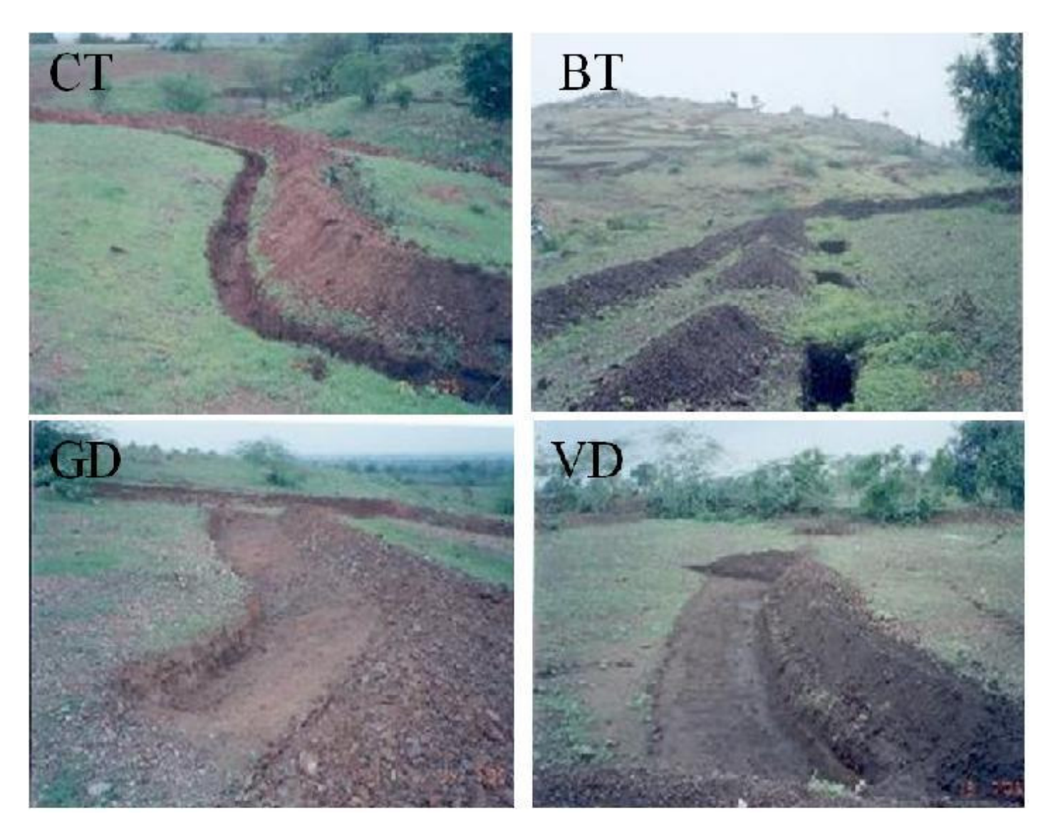
Figure 2. Rainwater harvesting devices applied under afforestation in degraded Aravalli, Rajasthan, India. CT, contour trench; BT, Box trench; GD, Gradonie; and VD, V-ditch.

0.40 cm collar diameter were planted in a pit of size 45 \times 45 \times 45 cm. There were three slope categories that is, <10% slope, 10-20% slope and >20% and five rainwater harvesting treatments plots replicated five times (distributed in about 17 ha area) to provide 75 plots.