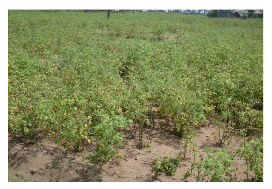
Figure 1. Overview of growing tomato in a farmer's field.