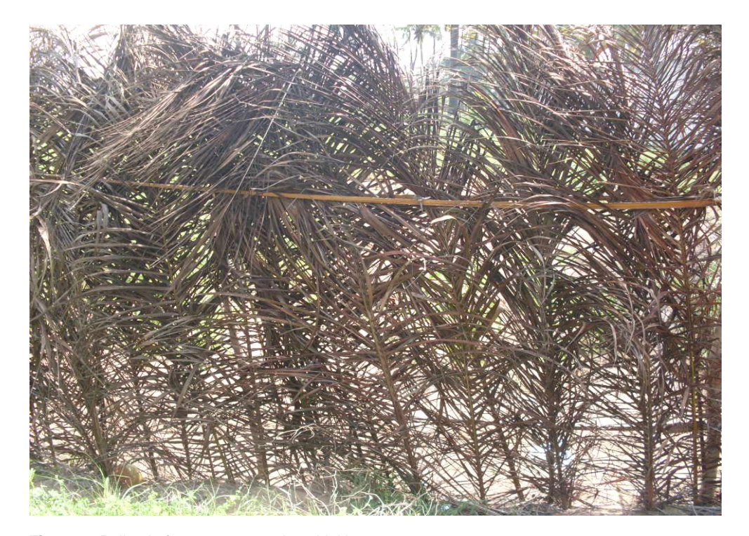
Figure 3. Palisade fence set up against tidal breeze.

0 = don't know; 1 = bad; 2 = average; 3 = good; 4 = very good.