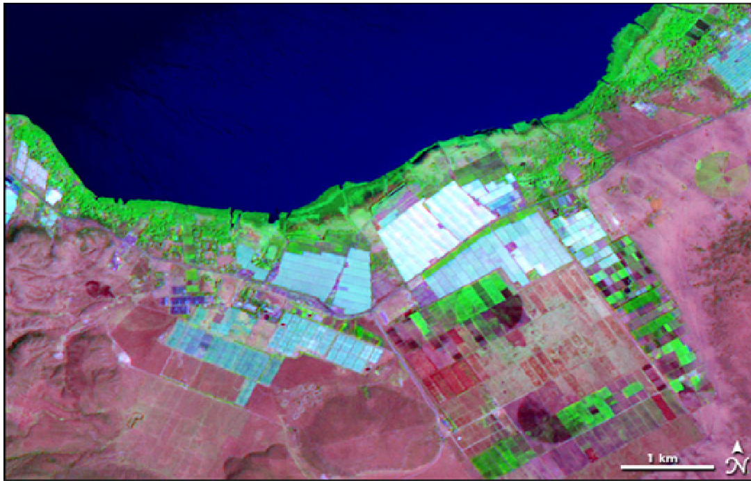
Figure 2. The region around Lake Naivasha in Kenya produces fresh cut flowers that supply the demand in Europe at the cost of pesticide loading of the ecosystem, affecting aquatic life including fish and large animals such as the hippopotamus. NASA image created by Jesse Allen, using data provided courtesy of NASA/GSFC/METI/ERSDAC/JAROS, and U.S./Japan ASTER Science Team. http://earthobservatory.nasa.gov:80/Newsroom/NewImages/images.php3?img_id=17976