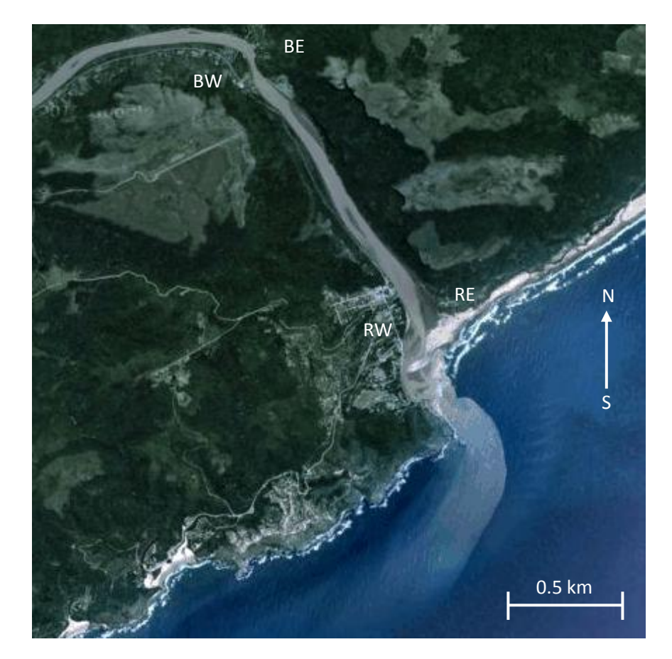
Figure 2. Sampling locations along the Umzimvubu River at the mouth RE and RW and at the bridge BE and BW.