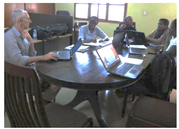
Discussion with nutritionists on diet modification