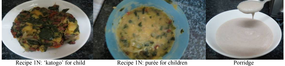
aged between 12-23 months and adult