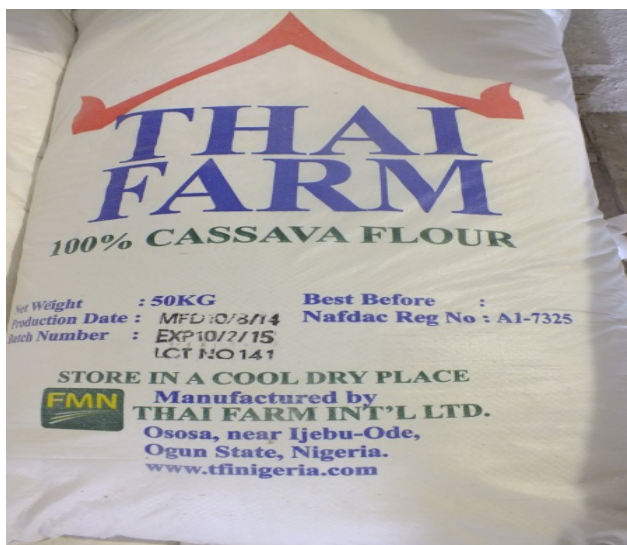
Figure 3: High quality cassava flour produced in Nigeria

For instance, in Uganda a private entrepreneur (Adyaka Farms in Lira) who had been processing his cassava mash into HQCF through sun drying was encouraged and supported to purchase a flash drier. Prior to the acquisition of the more efficient drier, his monthly HQCF production was an average of 8.8 tons. Upon the commissioning of the drier, his monthly production has increased to 29.6 tons while providing additional employment for 28 people.