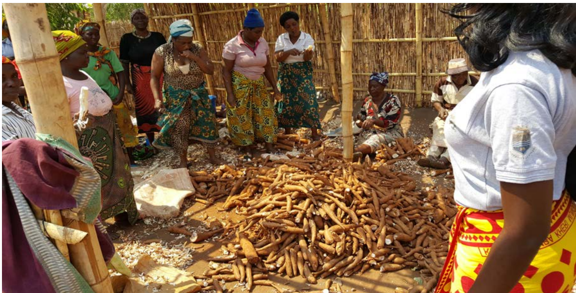
Figure 4: Women peeling fresh cassava roots in Malawi

Uptake of cassava roots by the animal feed industry (including aquaculture) has also been very low. This ranges from 1.3% (Nigeria) to 6.3% (Malawi) in 2016 [7].