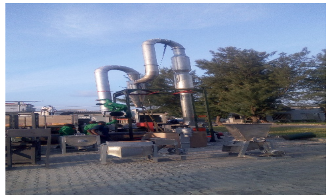
Figure 2: Cassava drying technologies: Solar drying in Uganda (left) flash drying in Nigeria (right)

A key focus of the Project is to open up alternative markets besides the traditional uses for fresh cassava roots to absorb increases in production. Some of the new value chains being promoted include: