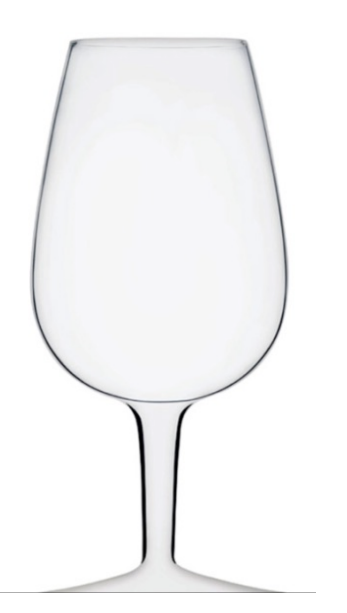
Figure 2: ISO official wine tasting glass