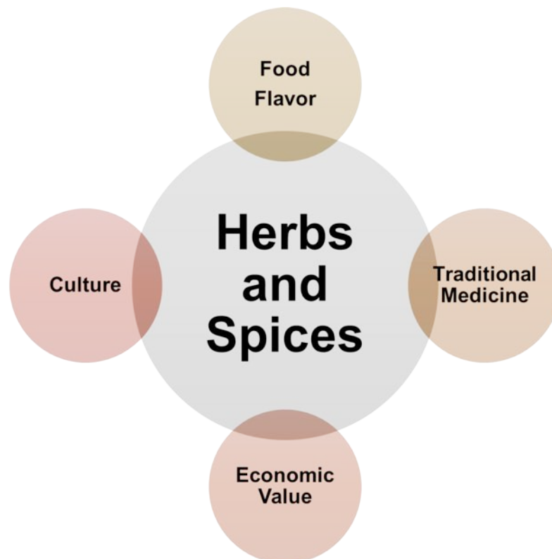
Figure 3: The use of herbs and spices in Tabaru ethnic group. There are four main functions of herbs and spices that integrated each other such as traditional medicine, economic value, culture, and food flavor

In Tabaru ethnic group, clove and nutmeg are a welfare symbol for indigenous groups in cultural activities such as weddings and traditional parties in the village. Herbs and spices that are used by communities become a source of income that can reduce poverty, help cure diseases and reduce macronutrient deficiency [27]. Consuming spice plants as flavorant in food makes the food more tasty and enjoyable [2]. Bioactive substances in spice plants can also be curative agents to fight several types of disease-causing bacteria [28]. Herbs and spices are also a source of culinary tourism for local people [29]. Generally, locals cultivate spices as part of their concern in maintaining indigenous food resources. Simple consumption patterns cause them not to depend on other imported food sources. Inside the Tabaru ethnic group, the barter exchange system is still found, especially in local food crops.