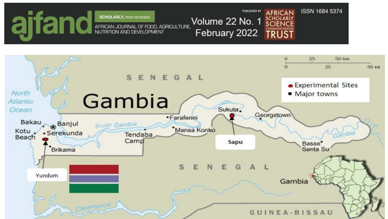
Figure 1: The location of the two study sites in The Gambia (Yundum and Sapu)