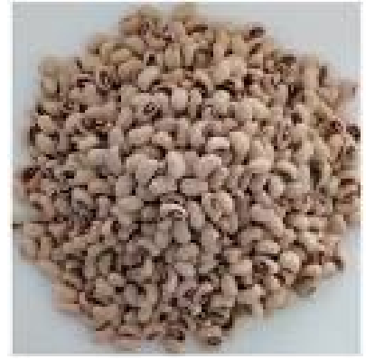
Figure 2: Cowpea grains

Finger millet was cleaned, and malting carried out according to a method detailed by [29]. Finger millet grains (2kg) were washed and steeped in a 2-litre water container for a period of 24 hours. Water was changed after every 6 h during steeping. The finger millet grains were then washed and germinated in ventilated cupboards for 2 days at an ambient temperature of 28 °C with regular sprinkling of water. The malted finger millet grains were removed and dried in an oven at 48 \pm 2 °C for 24 hours. The grains were milled using an experimental mill fitted with a 500 µm opening screen to give whole grain flour and stored at 9-10 °C until further analysis. Cowpeas grains (Fig 2) were also screened, cleaned, and milled into flour. Cowpeas were hydrated, germinated, and fermented to increase nutrition quality and reduce antinutritional factors. Cowpeas were soaked for 8 hrs, germinated for about 52 hours at 25°C and fermented for 24 hours at 30°C. However, this did not affect its proximate composition of both finger millet and cowpeas.