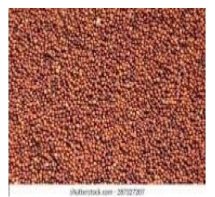
Figure 3: Finger millet (Rapoko) grains