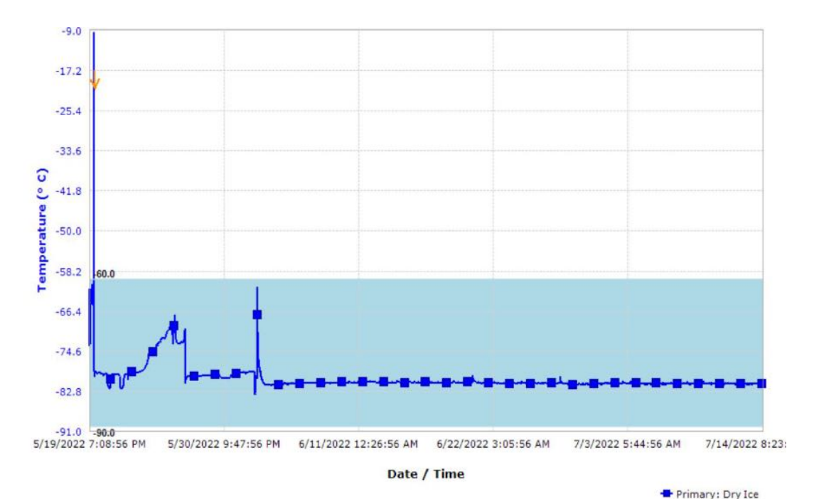
Figure 3: Snapshot of feedback from a real-time temperature-monitoring tool (TempTale Ultra BLE) showing temperature tracking of a frozen sample, in dryice, in transit