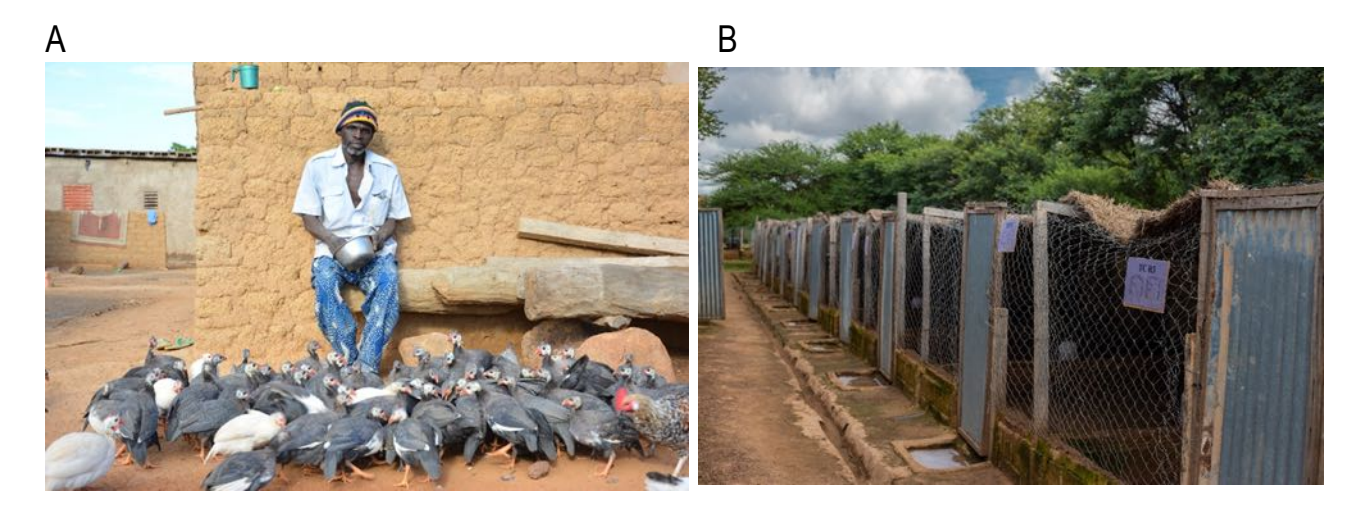
Figure 1: Guinea fowl and housing

fowls per replication (9 females and 3 males), giving a total of twelve (12) poultry houses (Figure 1B).