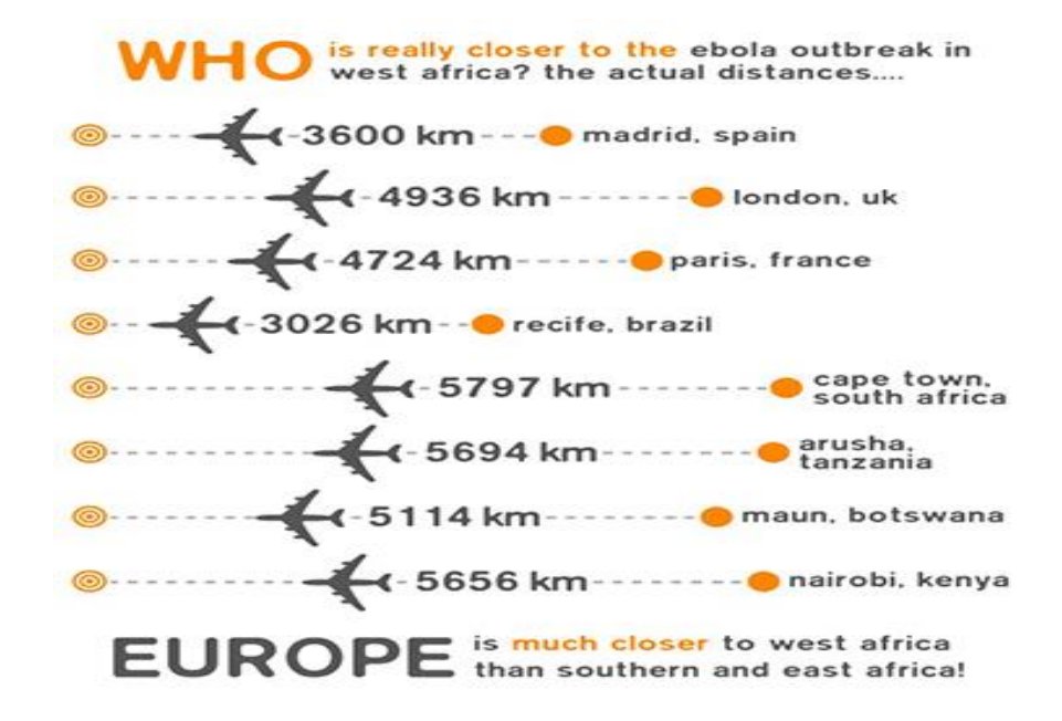
Figure 2 : "Adventure Life" specialist travel agent tried to explain how low the risk of exposure to Africa is in many African nations advocating for more holiday in southern and east Africa.