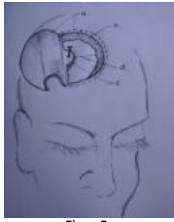
Figure3: Illustration of operative technique

Cranial computerized tomography scan brain (coronal)