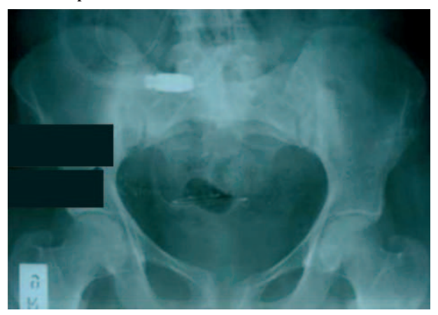
Figure 1: Plain abdominal radiograph showing the pelvic location of the peritoneal dialysis catheter tip which appears to be compressed