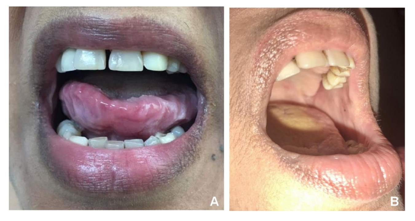
Figure 2: Significant improvement one month after the treatment