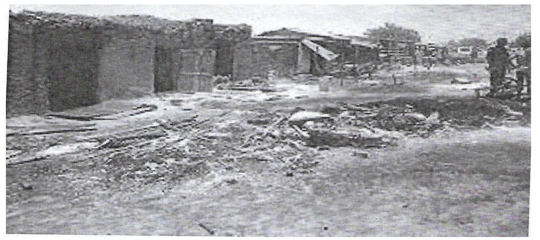
Figure 5: Burnt village by pastoral conflict in Benue state

Empirical evidence shows that Fulani herdsmen often clash with farmers in Benue state. This has claimed many lives, wrecked homes and displaced thousands of people in the