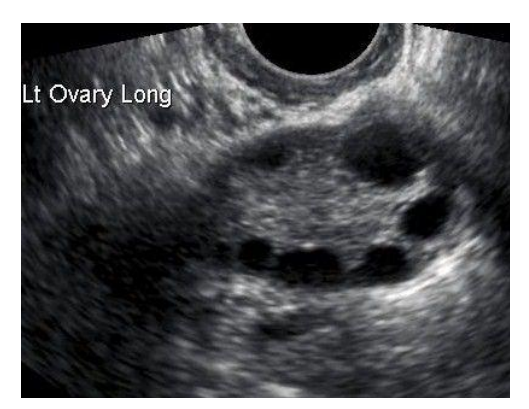
Figure 1: Normal Ovary

Polycystic ovary syndrome is one of the most common endocrine disorders, and the presence of polycystic ovary morphology is a cardinal feature of polycystic ovary syndrome. Typically the ovaries are enlarged with multiple follicles arranged peripherally around a dense stroma, but the criteria with sufficient specificity and sensitivity to define polycystic ovary morphology are the presence of 12 or more follicles of 2-9mm diameter in each ovary, and/or increased ovarian volume of more than 10mls<sup>1</sup> (figures 1 and 2).