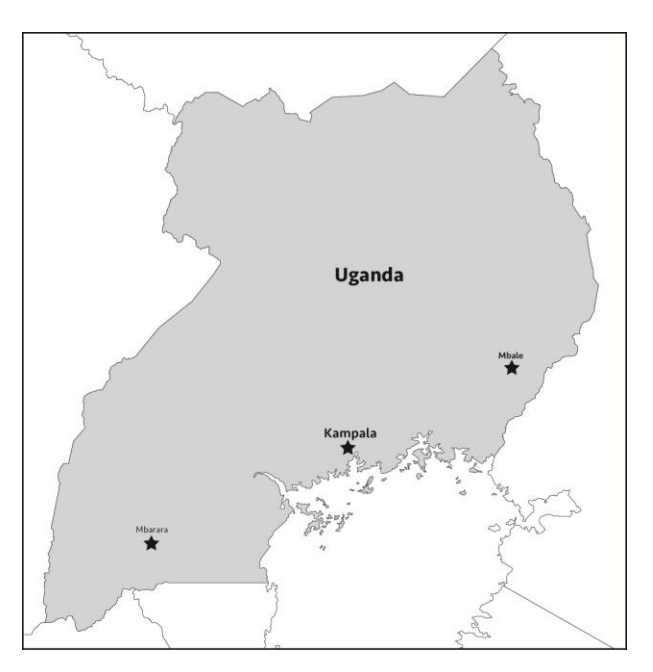
Figure 2: Districts involved in the rapid assessment

introduction of the SILCS Diaphragm into Uganda.