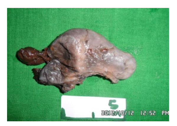
Figure 1: Gross appearance of the Left Salpingectomy specimen with significant destruction of the fimbrial end.

counseled on her condition and the need to present early whenever she missed her menstruation. She has since been well.