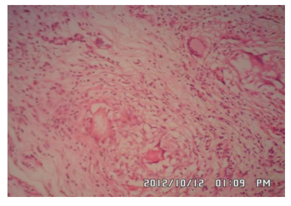
Figure 3: Section showing tubal mural expansion by oval granulomata with sprinkling by